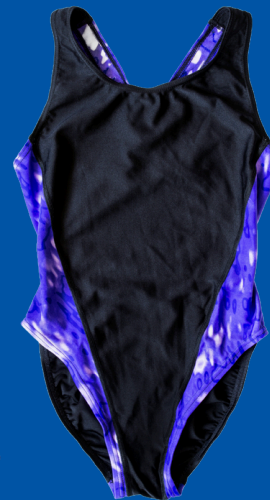
One piece swimming suit